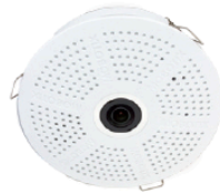
c26 with lens B016